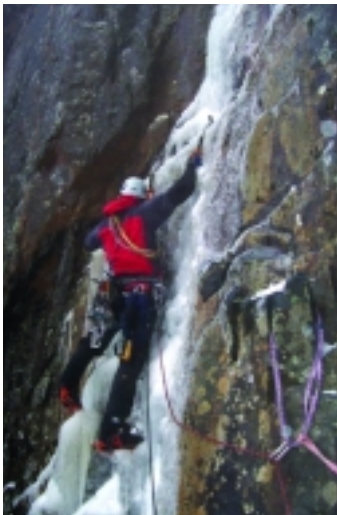
Thin ice on the Black Dike-Will Mayo last October.